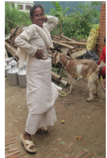
A widow wearing white as required in Nepal. This is one of the widows who received animals from CRI.

CRI staff also attended an international conference in Kathmandu, Nepal as invited speakers. One of the speakers with CRI is a widow and shared her perspective with the widows at the conference.